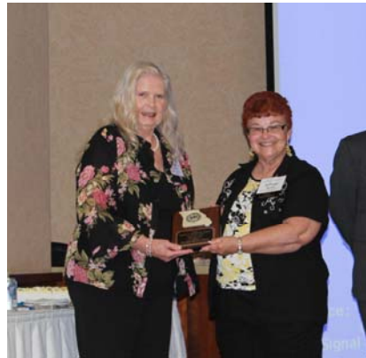
Robert Northcutt Award Kearney Courier Clean Air Kearney