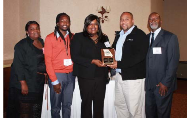
Group Merit Award Kansas City Health Department Aim4Peace Violence Prevention Program